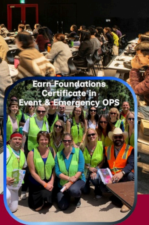
Earn Foundations Certificate in Event & Emergency OPS