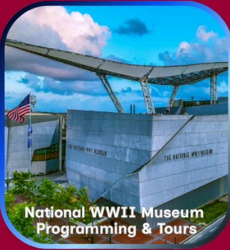
National WWII Museum Programming & Tours