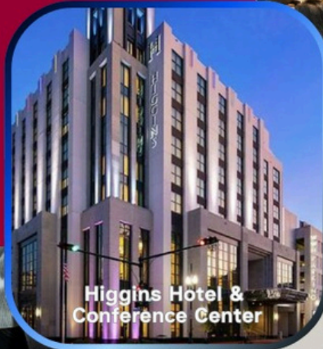
Higgins Hotel & Conference Center