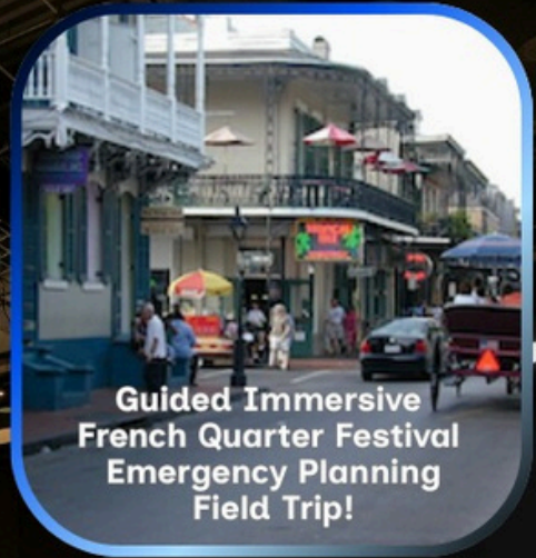
Guided Immersive French Quarter Festival Emergency Planning Field Trip!