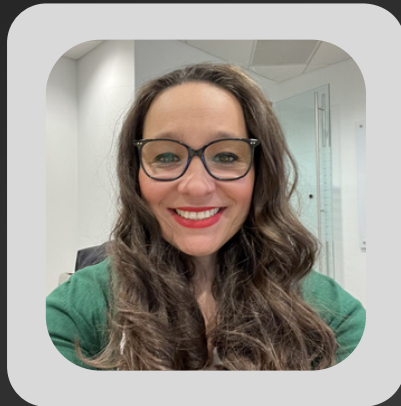
Dawn Grandsart Axis Communications