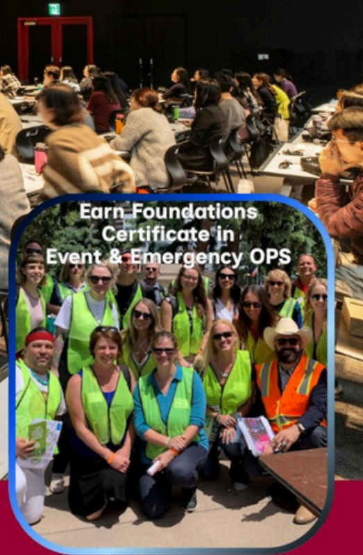
Earn Foundations Certificate in Event & Emergency OPS